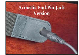
Acoustic End-Pin-Jack Version