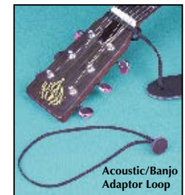
Acoustic/Banjo Adaptor Loop